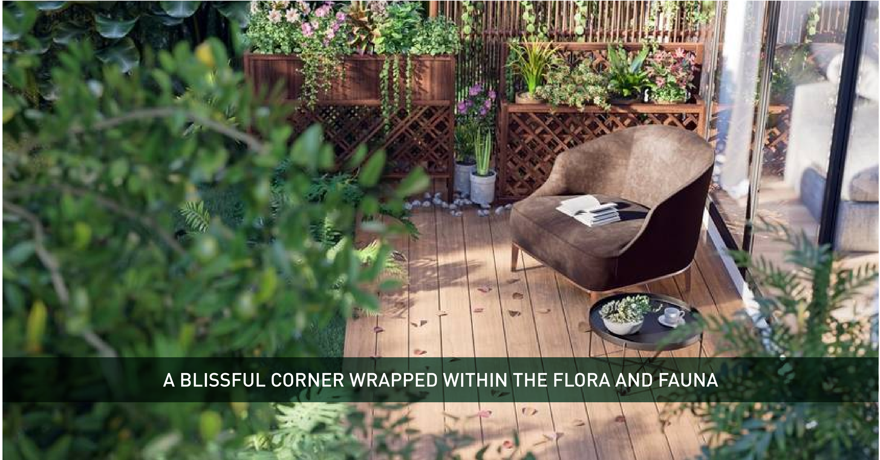
A BLISSFUL CORNER WRAPPED WITHIN THE FLORA AND FAUNA